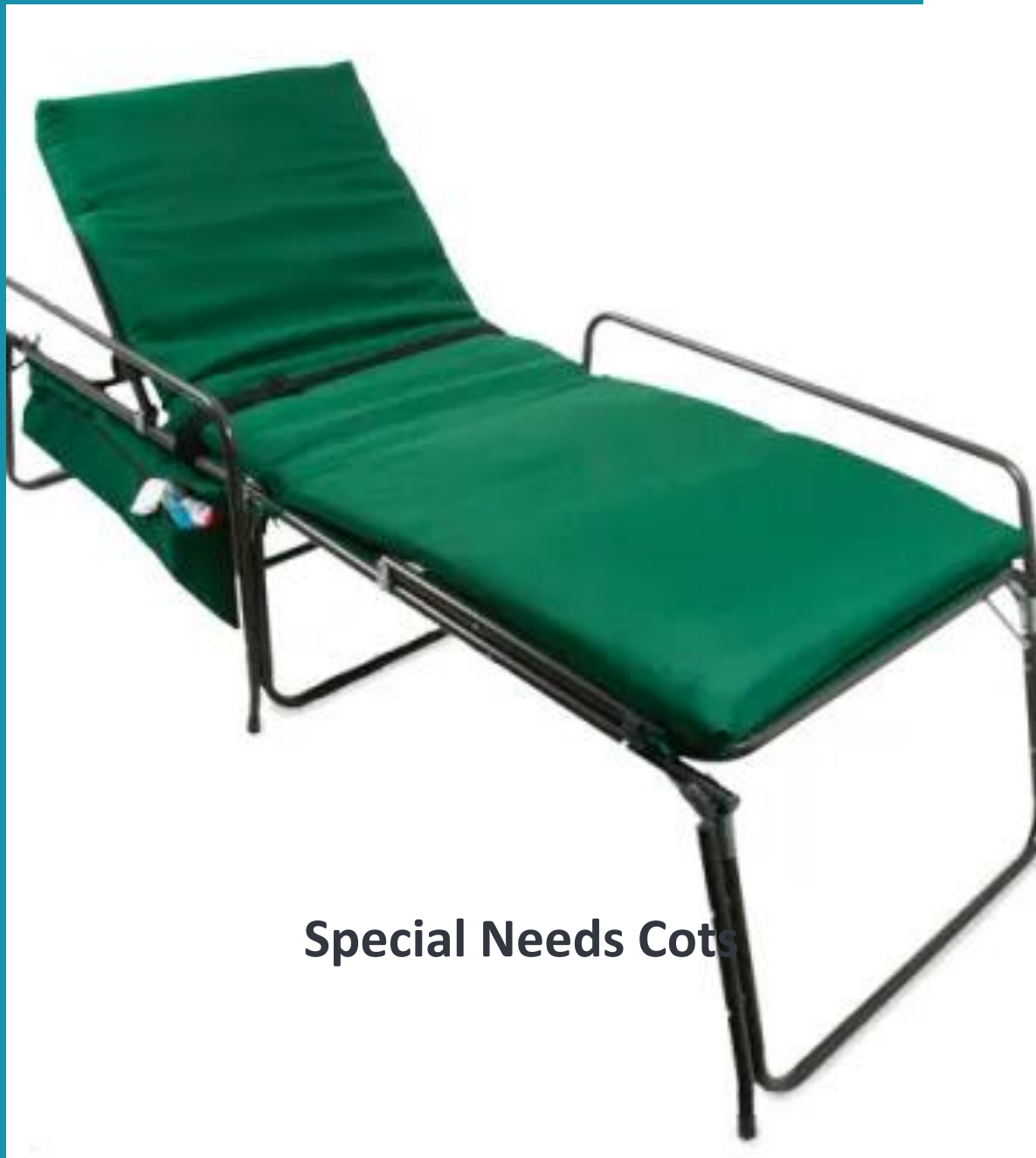
Special Needs Cots