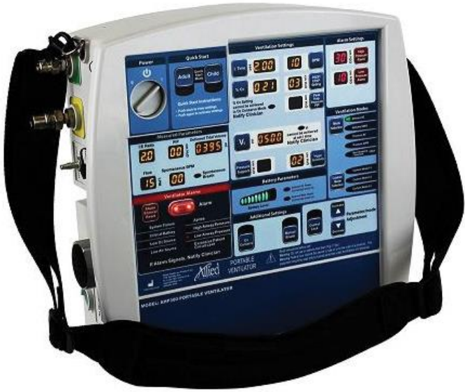
AHP 300 Ventilators