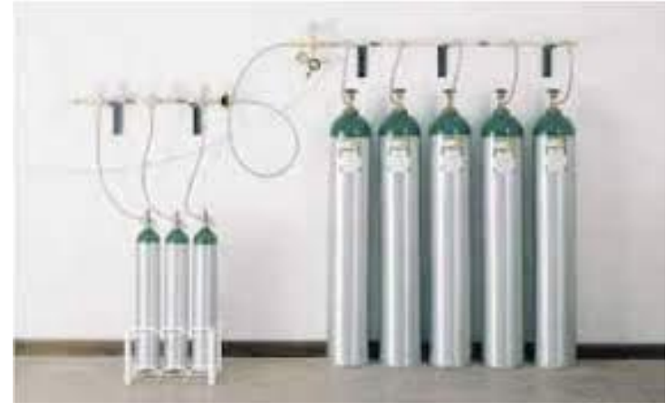
Oxygen Refill Station