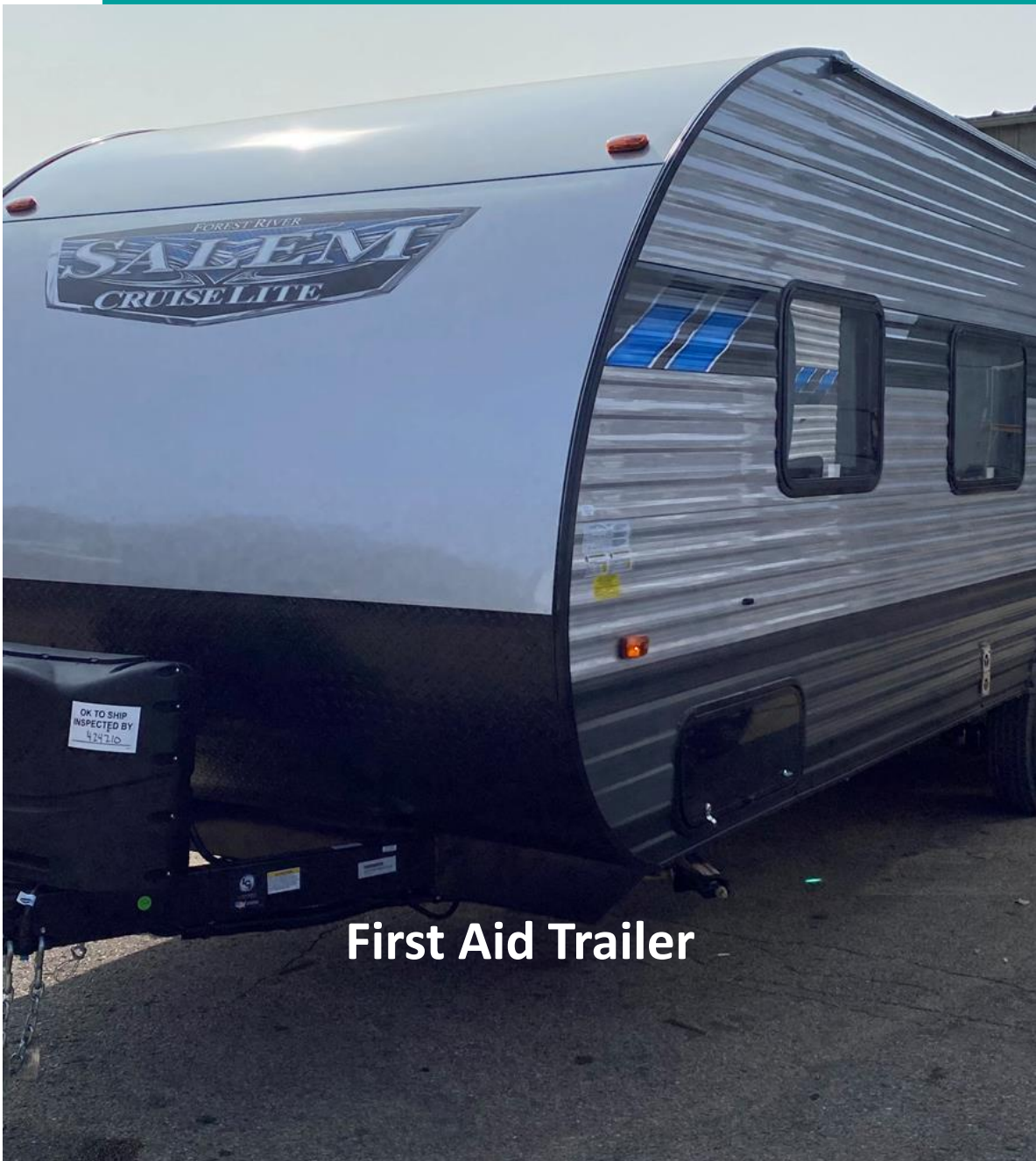
First Aid Trailer